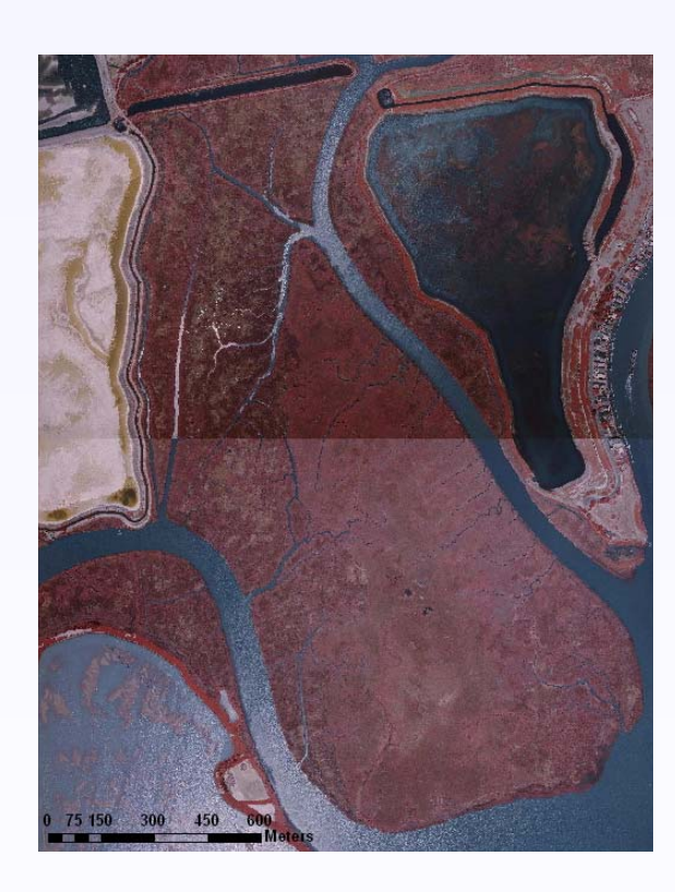
Browns Island Brackish marsh